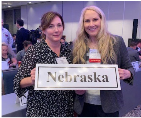
2022 Council Meeting Hilton Union Square San Francisco

Thanks again for the opportunity to be at Council. See you in the New Year!